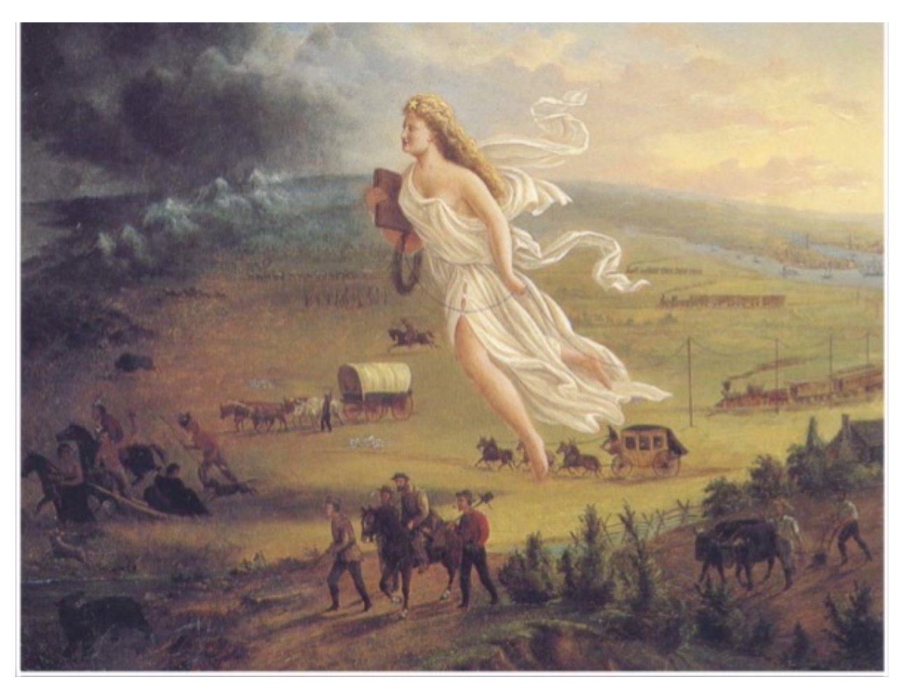
Manifest Destiny 1872

creating this industrial economy. As she travels West what follows is light and a bright future. In her arm she cradles the telegraph cable and as she glides westward she is connecting all of the lands and the peoples to this system and markets all the way to Europe. The ships and